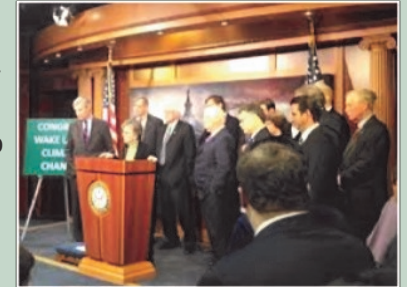
Members of the Senate Climate Action Task Force Members

Senate Democrats have joined together for the Climate Action Task Force to address climate issues across the country. The Task Force is comprised of 22 senators from across the country.